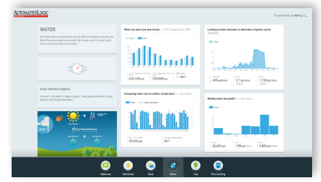
Showcase renewable systems, green building features, and sustainability programs.

1150 Roberts Boulevard, Kennesaw, Georgia 30144 770-429-3000 Fax 770-429-3001 | www.automatedlogic.com © Automated Logic 2017